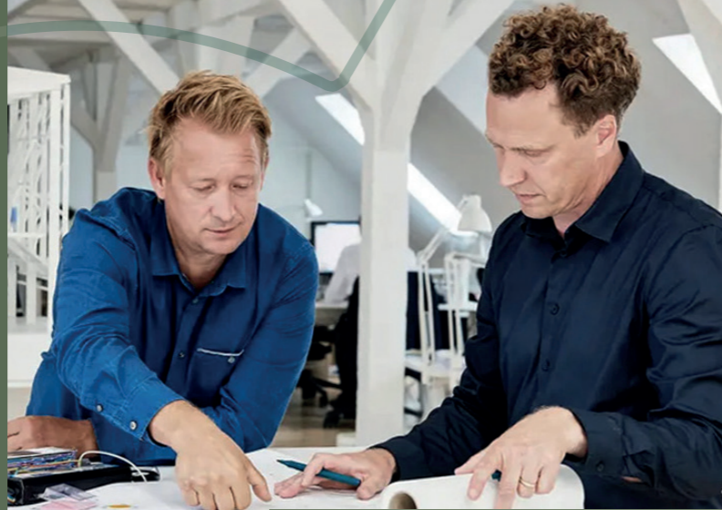
Design by AART Designers